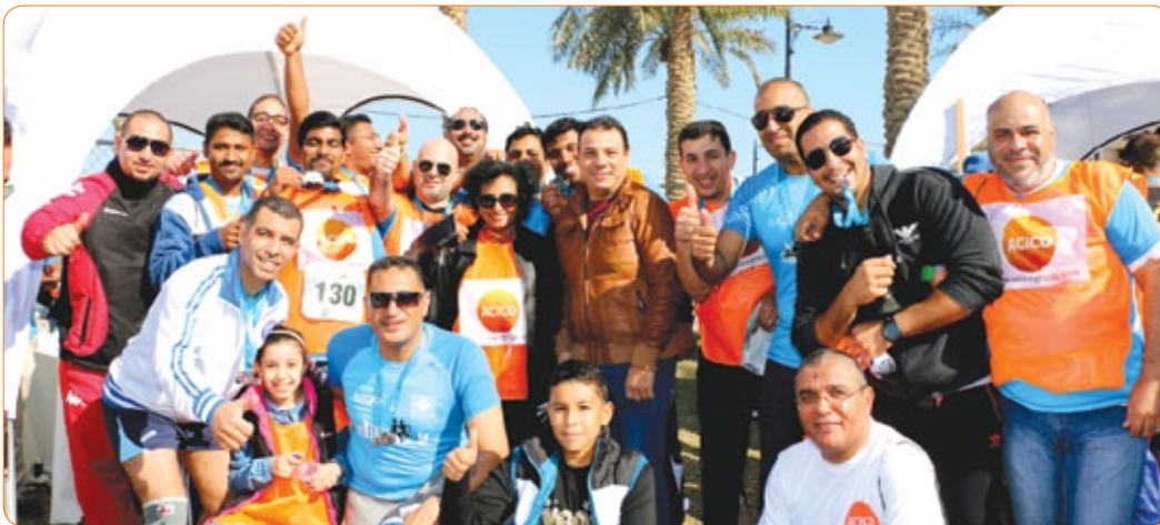
• Number of participants

Large number of ACICO employees took part in the charitable (Q8 Marathon).