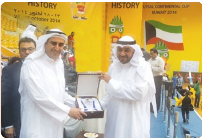
• Handing a memorial shield to ACICO by the championship administration