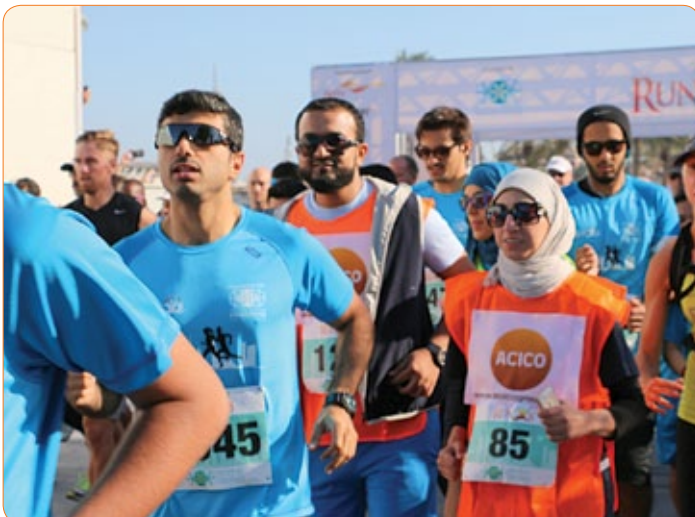
• The competitors launch from the start line