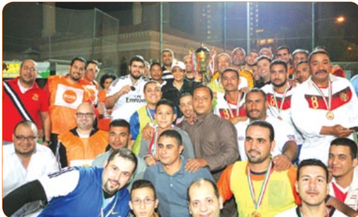
● The winning teams