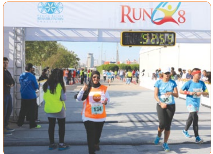
• The competitors arrival to finish line