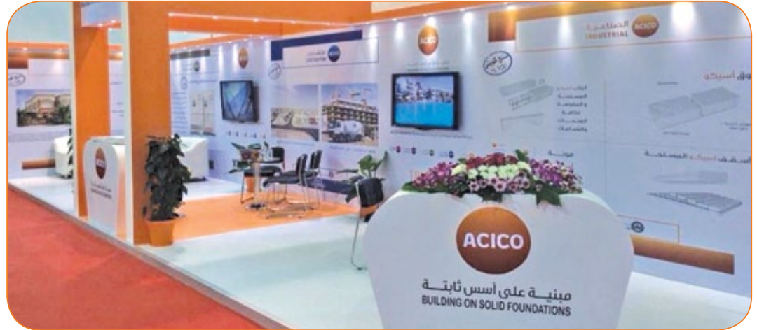
• The company's booth in the exhibition