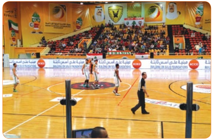
• Portion of the matches