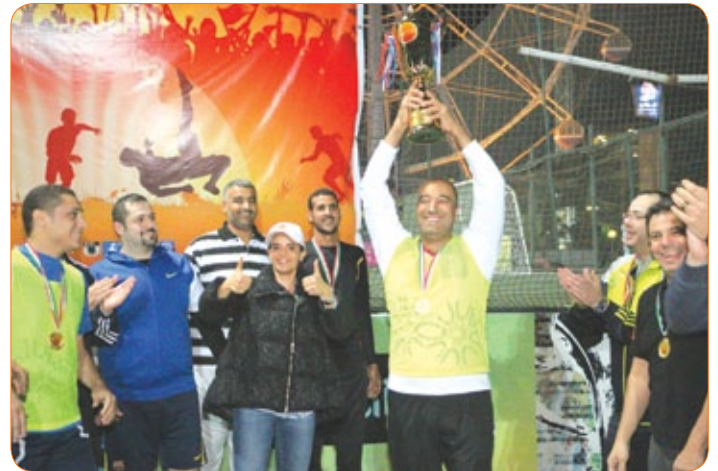
● Crowning the winning team